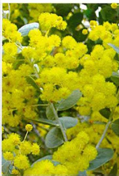
Snowy River Wattle ( Acacia boormanii )