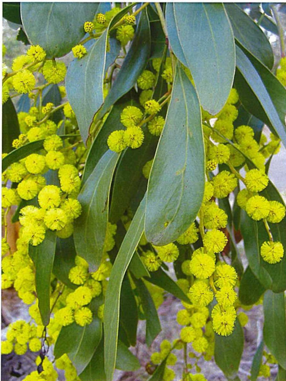
Golden Wattle ( Acacia pycnantha )