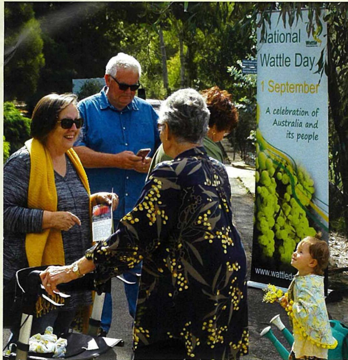
Getting ready to plant Golden Wattle ( Acacia pycnantha - Australia's national floral emblem) at the Australian National Botanic Garden. Canberra.