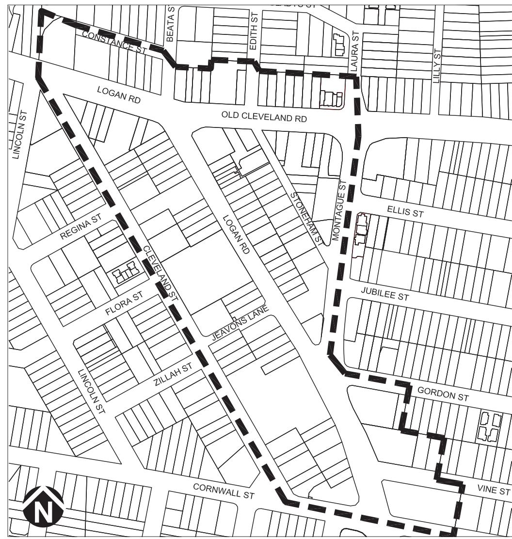
— — — Extent requiring footway treatment

Council requirements for footway upgrades – including standards, standard drawings and reference specifications are detailed in this manual. (Refer to Chapter 3 Streetscape Design, Section 3B Footway Elements and Materials.)