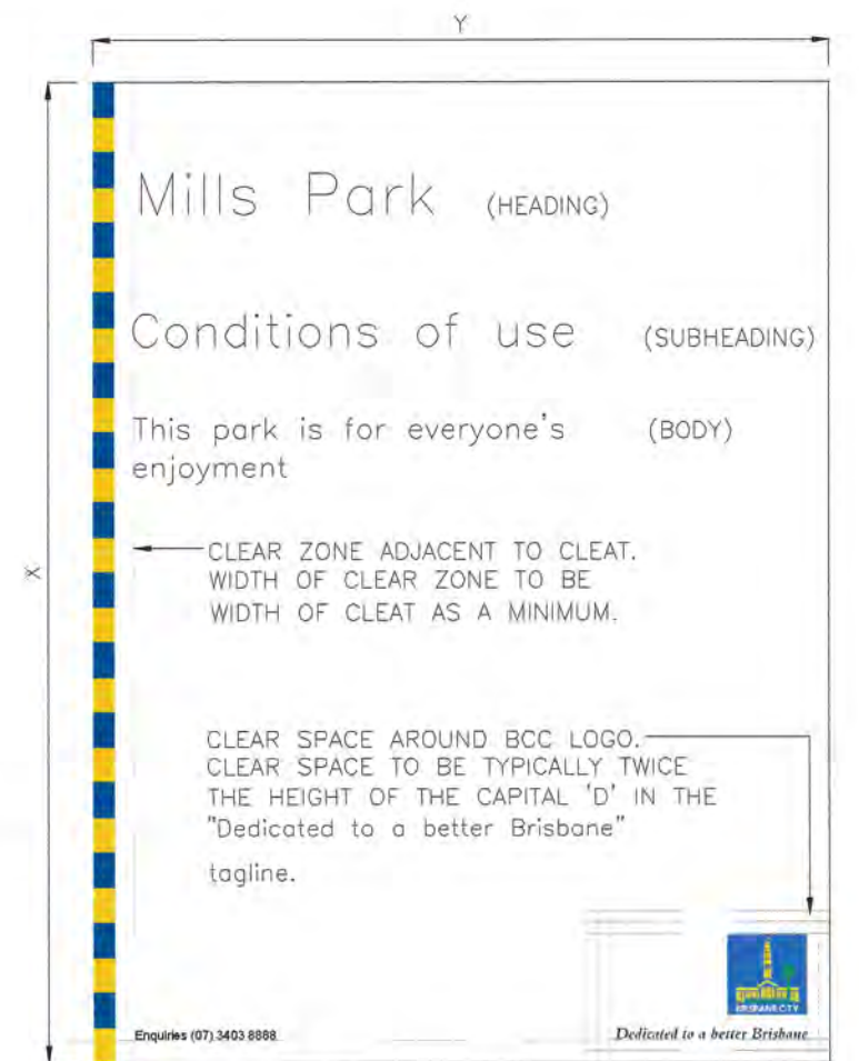
TYPICAL GRAPHIC LAYOUT Enquires (07) 3403 8888 PORTRAIT ORIENTATION CLEAT (SIZE AS PER TABLE) REFER TO TABLE BELOW FOR TEXT STYLE SIZES RELATIVE TO SIGN SIZE. CLEAT UNIT DETAIL