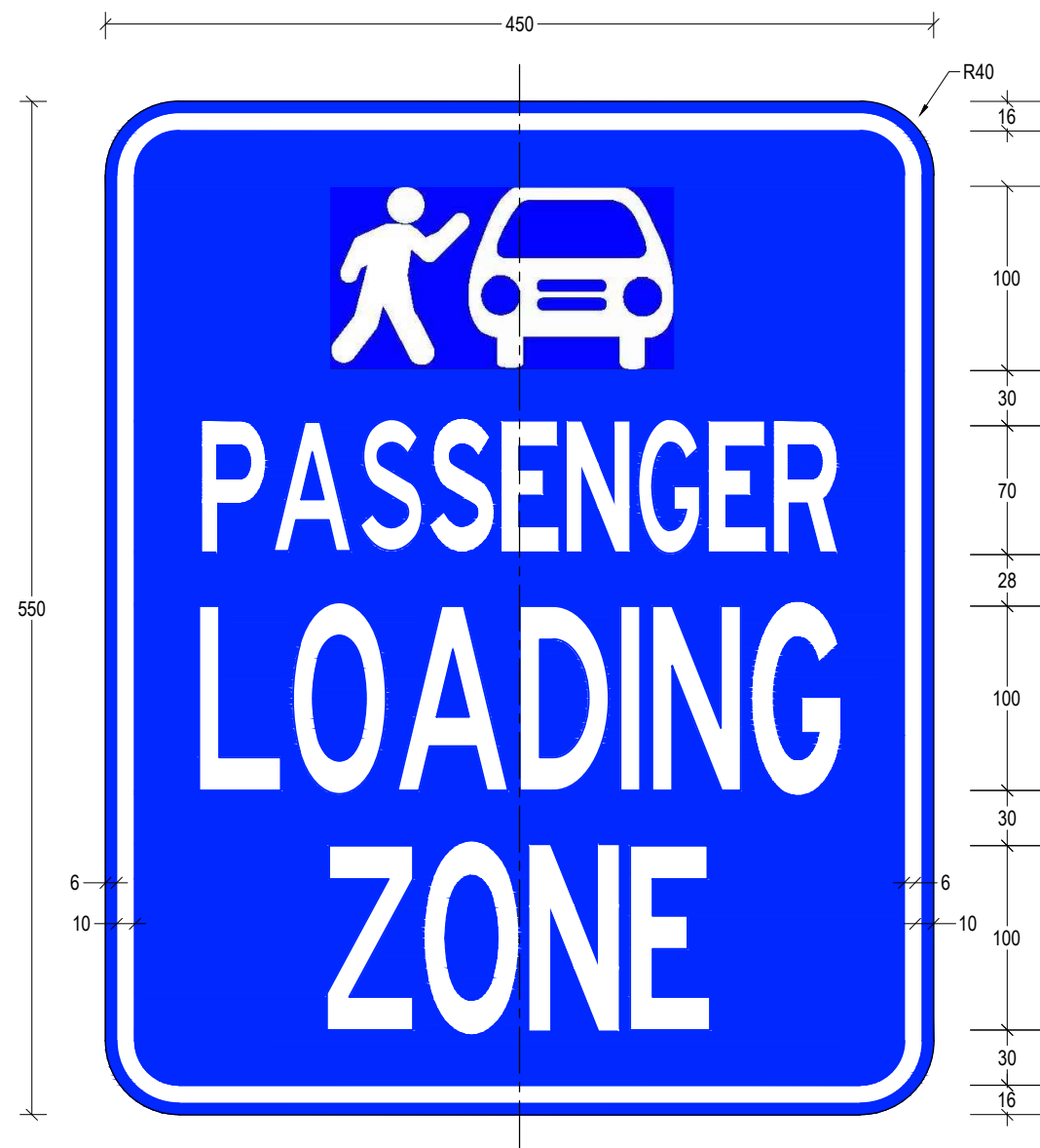
ENHANCED PASSENGER LOADING ZONE SIGN SIGN CODE: PLZ