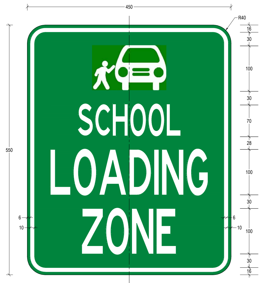
ENHANCED SCHOOL LOADING ZONE SIGN SIGN CODE: SLZ